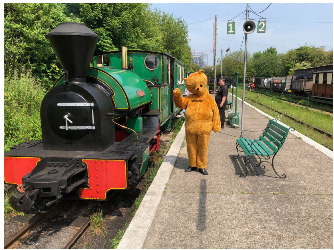
Figure 2 - Teddy Bear with 'Melior' at Kemsley Down station - photo available to download here